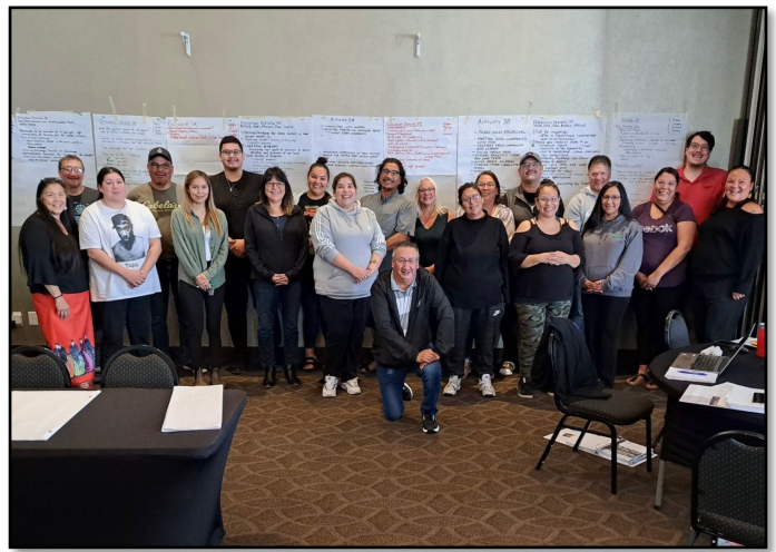
Pictures taken at the Sandman Hotel, September 23-27, 2024 (In-person class week)

19 students are currently in course 100 from the 2nd intake.