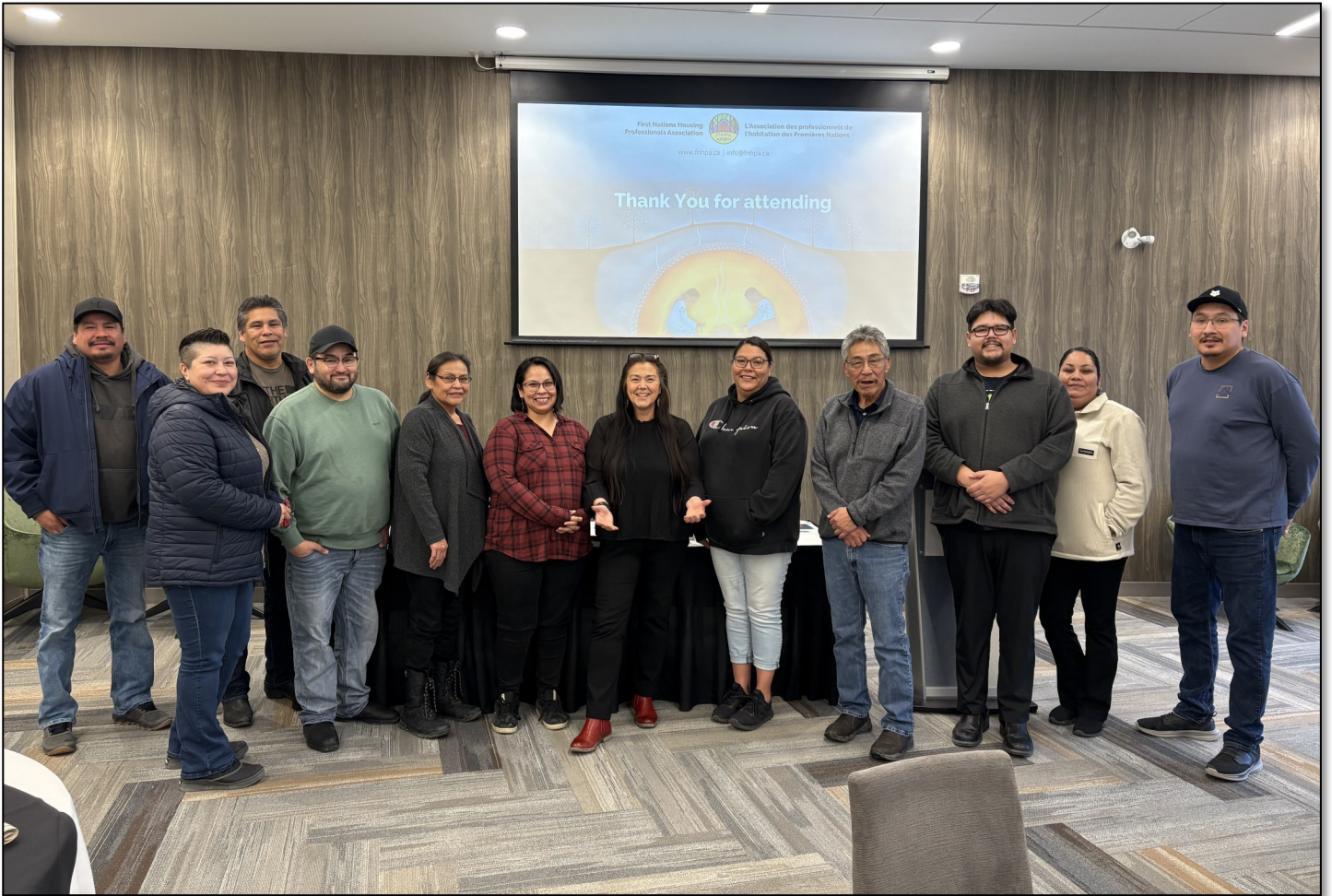
Housing Costs Workshop Jan. 15 & 16, 2025—Wyndham Garden Hotel