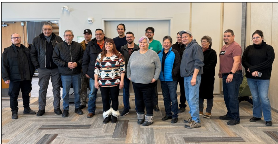
Picture taken at the Strategic Planning Session—Wyndham Garden Hotel, January 22, 2025

We're excited to share with you some exciting updates and news from our MIHCEMI Working Group.