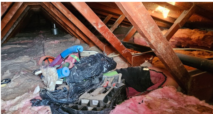
First two pictures – before and after upgrades

Contact IndigenousPrograms@efficiencyMB.ca for more information.